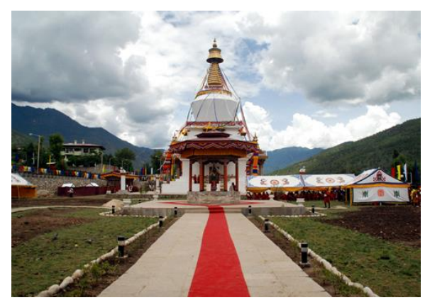
Do Drul Chorten

The Chorten is clearly visible by the unique golden top which can be seen from various places in Gangtok, locals believed the entire place was haunted by evil spirits and in 1946 the celebrated lama of Tibet Trulshig Rinpoche built this structure to drive away the spirits.